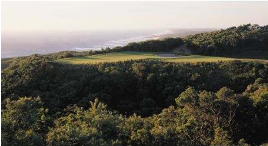
The Old Course

Ranked 24 th in The Australian Top 100 Golf Courses (Golf Digest 2008), The Old Course is a very undulating and naturally sloping course, with almost every hole offering superb ocean views. The layout of the 6313 metre, par 72 Course is situated in a rugged coastal region and boasts perfectly manicured fairways, closely surrounded by thick native vegetation. Combine this with tiered greens and sharp bunkering, the Old Course will certainly provide a wonderful experience for all golfers from the novice to the seasoned campaigner.